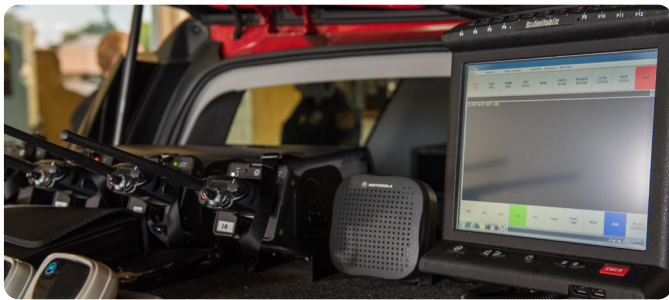
Patriot All-in-One MDC