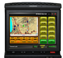
Patriot A-i-O MDC | Side Profile | User Interface

Beyond knowing exactly where a vehicle is at the time of dispatch, the ability to track a vehicle as they respond through urban, suburban and rural environments on the vehicle location system, is invaluable, according to CAL FIRE. A dispatcher or incident commander on a large-scale incident can provide turn-by-turn directions in remote or unfamiliar areas if needed, increasing the efficiency of any response. Crew members also have the incident detail and up-to-date information at their fingertips and no longer have to rely on hand-written notes scribbled onto scraps of paper as they are being dispatched; the address and other potential life-saving information is displayed on the Patriot's screen along with a live map that routes them to the scene. With the entire map database contained within the MDC, the crew tracks their own movements and can also backtrack (breadcrumb) out of unfamiliar or low visibility areas even if network connectivity is lost.